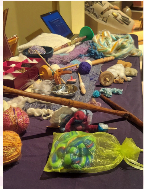
Spinning, Fiber, and Physics Demo at the LMD ScienceFest at the Ag Museum.