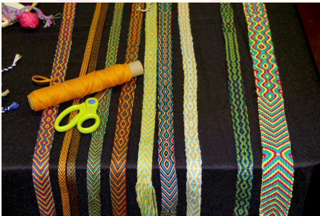
Examples of tablet woven bands by Angela Schneider