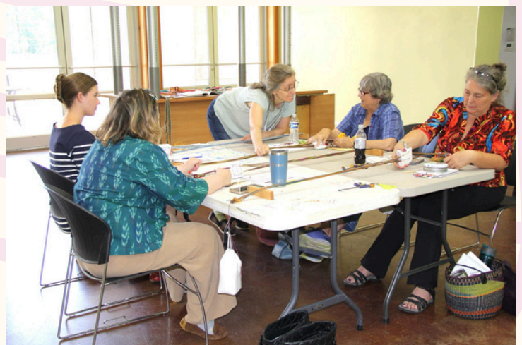
CWSG members making their own tablet woven bands during Angela's class.